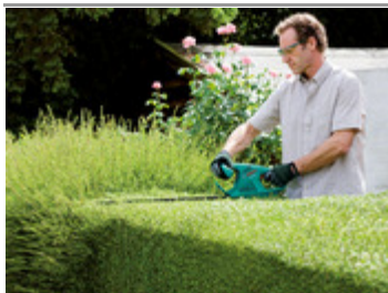
High-torque "High-Power" motor