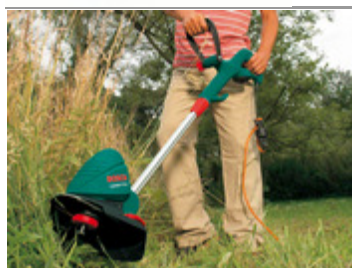
Versatile with 2 spools