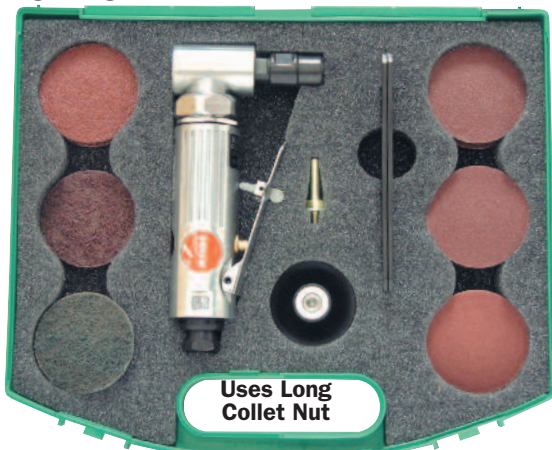
Uses Long Collet Nut

for 10mm air hose, 90psi air pressure, 4cfm* air consumption. Supplied in a sturdy plastic carry case.