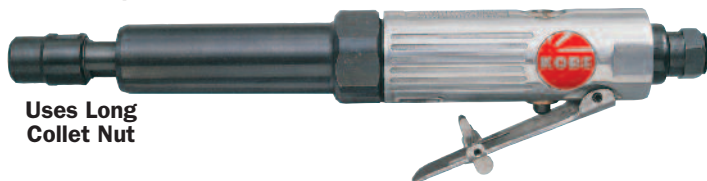
Uses Long Collet Nut

Collet size: 6mm. Air inlet thread: 1/4" NPT. Minimum air hose size (ID): 10mm (3/8"). Air pressure: 90psi. Air consumption: 4cfm*.