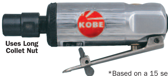
Uses Long Collet Nut

Collet size: 6mm. Air inlet thread: 1/4" NPT. Minimum air hose size (ID): 10mm (3/8"). Air pressure: 90psi. Air consumption: 4cfm*. Sound pressure level: 94dBA. Sound power level: 103dBA. Vibration level: 5.0m/s 2 . Overall length: 120mm.