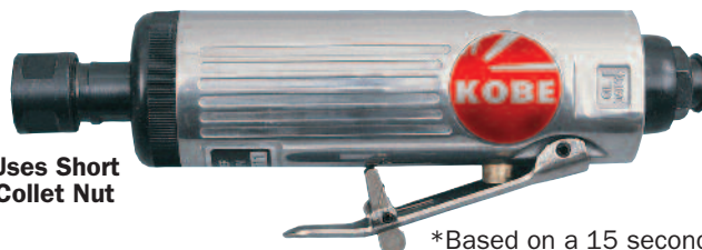
Uses Short Collet Nut

Collet size: 6mm. Air inlet thread: 1/4" NPT. Minimum air hose size (ID): 10mm (3/8"). Air pressure: 90psi. Air consumption: 4cfm*. Sound pressure level: 93dBA. Sound power level: 103dBA. Vibration level: 5.4m/s 2 . Overall length: 170mm.