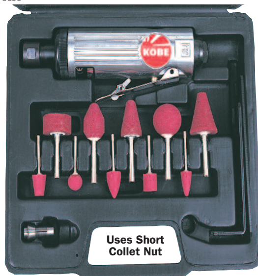
Uses Short Collet Nut

Includes: GD2206L, as shown below left. With 3 and 6mm collets, 10 assorted mounted points and robust blow moulded case.